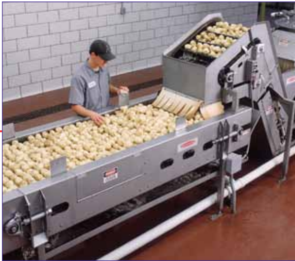
Inspection conveyors can be ordered with single or double lanes, movable cutting boards, and trim removal conveyors.

Choose the conveyor size and configuration that best fits your inspection process.