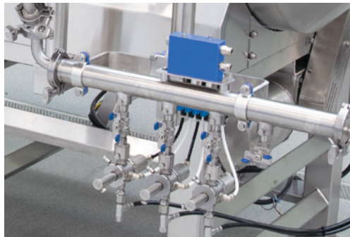
Positive displacement product pumps with adjustable micrometer settings.