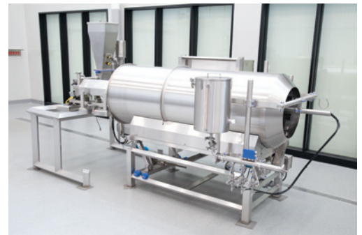
The MS-I Pulse Oil Spray Applicator as part of the Two-Stage Coating System.