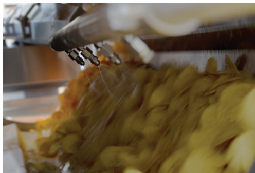
Airless spray application reduces overspray assuring accuracy in oil application rate.