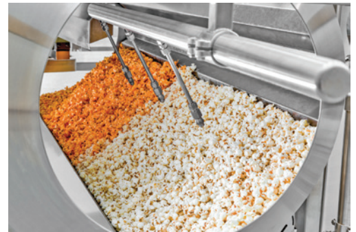
Remote nozzle spray bar with self-adjusting poppet nozzles. Achieve precise targeted spray application when used within a coating drum.